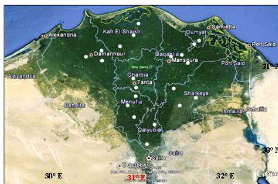
Fig. (1): A map showing the location of studied area in Nile Delta region

Where C = number of species common to both sites, a = total numbers of species in site 1, b total numbers of species in site 2. These indices are designed to equal 1 in absolute similarity and 0 if the sites are dissimilar and have no species in common.